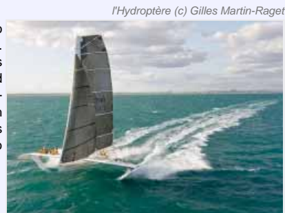
l'Hydroptère

Cosworth is a group of companies that provide advanced technologies to deliver optimal performance in a wide range of markets around the World. A cornerstone of the group is our electronics division (formerly known as Pi Research), which is recognized as a leader in the design and manufacture of high performance electronics for all levels of Motorsport - from Karts to Formula 1, World Superbikes to World Rallying. Cosworth electronics and software have recently become the choice for customers in a number of other markets including Marine, Aerospace and Sports to name a few.